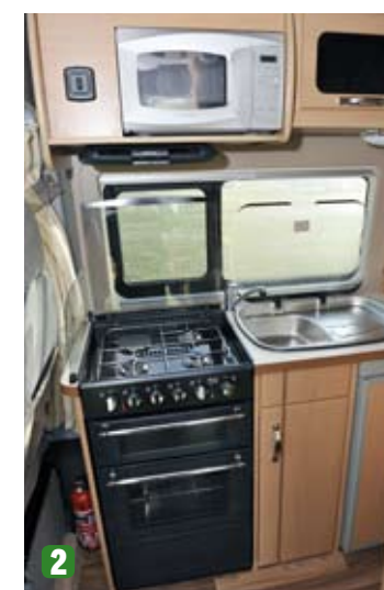
1 The lounge has long sofas and a wall-mounted flatscreen TV (inset) 2 The well-specified kitchen 3 A drop-down sink saves space in the washroom 4 The rear lounge sleeps two in either singles or a double bed 5 The sliding side door provides easy access to the accommodation area

★★★★☆ It's amazing how many van conversion kitchens are