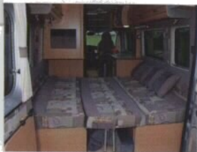
ABOVE: By night, a transverse double...