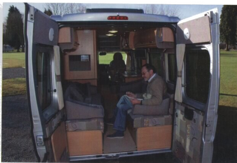
BELOW RIGHT: Dining in the Duo is a little cosy

breakers, with a second cupboard, 8in wide with two shelves, at the lounge end of the unit. An 11 in-deep pan locker sits beneath the oven (hot air ducting runs behind), while the small sliding plastic cutlery tray sits in the cupboard under the sink.