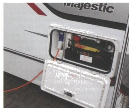
Leisure battery box with sheltered hook-up socket is a great feature

That said, some of us who occasionally tow heavy trailers (a caravan in our case) may wish for the extra grunt provided by the 130bhp engine option. Annoyingly and illogically, it's not available on this model, but is on the longer 155 and 180 models. The bigger 'vans share the same shape with the rest of the range and are broadly speaking