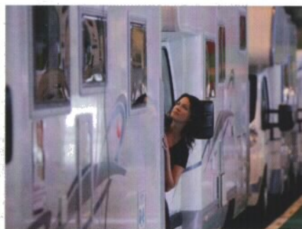
Head for a show to see a wide range of vans

Don't rush into it though – doing your homework will increase the likelihood of finding a motorhome with a layout that suits