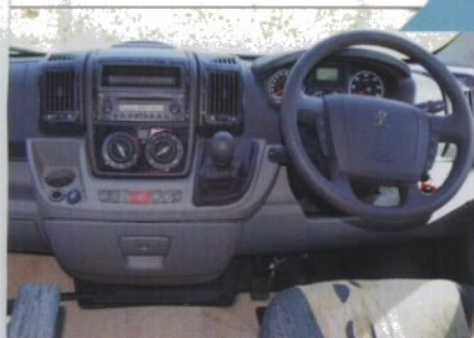
High-spec features in the Peugeot cab include passenger airbag and cruise control, but the stereo remains basic

DID YOU KNOW? Marquis Motorhomes was established in 1973