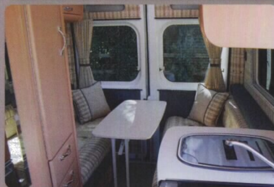
Rear lounge set-up features short settees. Free-standing table is maximum size, but can be tricky to get around

“There were plenty of admiring glances cast the Dorset's way”