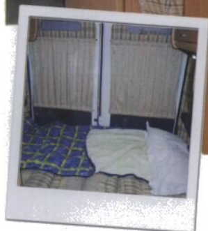
Top: comfortable rear lounge