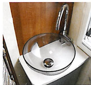
Above: The washbasin

rooflights, making it bright and airy inside. They also made it simple to ventilate and cool the unit after it had been shut up all day in the sun on our test weekend.